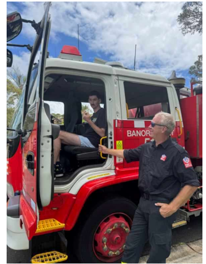
What another amazing year smashing goals and living our better lives at Pathways!