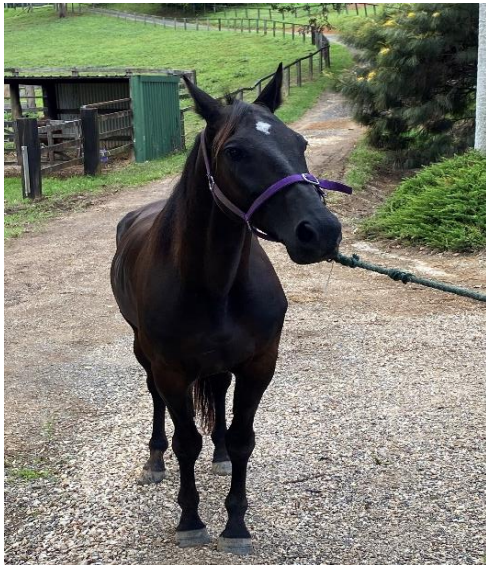
Pathways pets from far left to down and right: Dapper, Cobba, Pumpkin, Spud